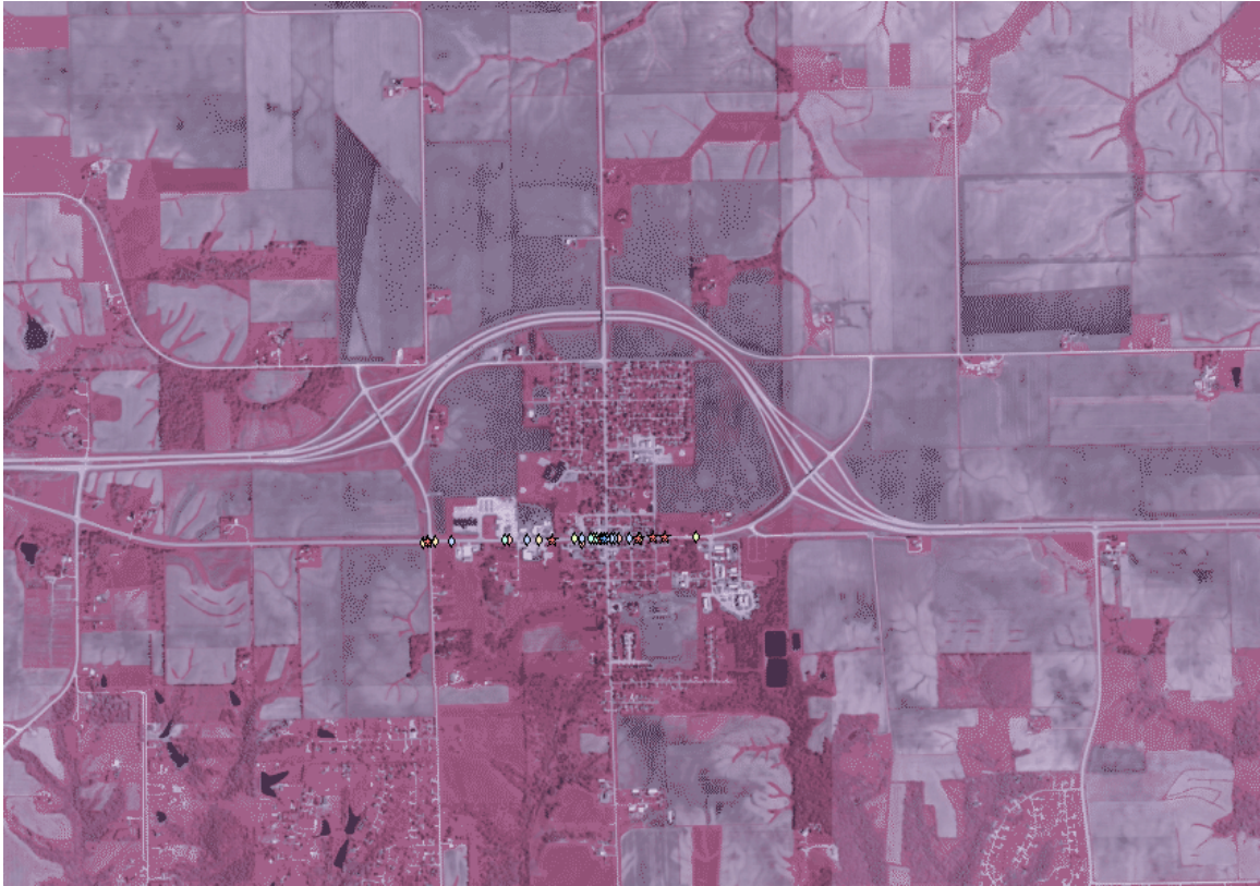
Figure 1 – Old US 61, Blue Grass

For each site the before case was taken as five years preceding the conversion year; the after case was taken as the years following the conversion year, up to five years total. Only the Storm Lake conversion did not include the full five years of before data; it was converted in 1993 but DOT data were not available for years before 1991. Table 2 includes a summary of the before and after data for each of the study sites analyzed.